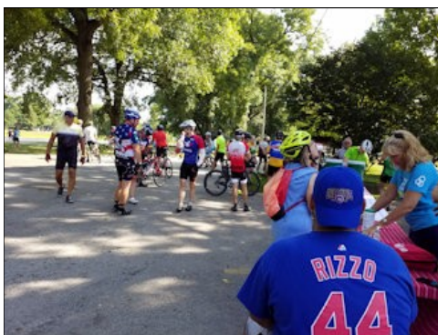
A picture from the 2 Rivers Century Bike Ride on Mومence Island...KARS members provided communications

Improving your net operation skills is an ongoing process...so start today!