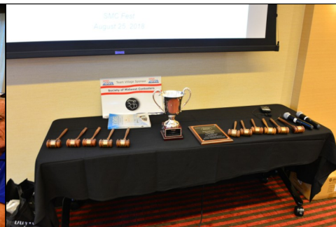
Trophies, Gavels & Plaques won by the SMC