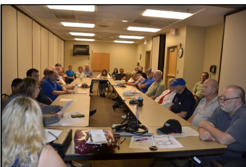
A large turnout for an August meeting!