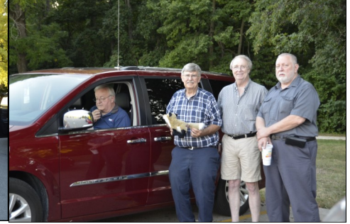
K9NR(fox), N9DWE, KA9TAG, N9IO