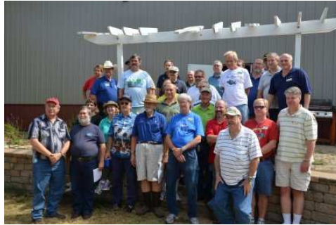
A group shot of some of the attendees