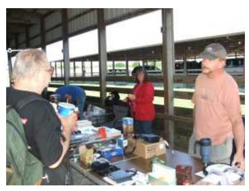
KARSFEST 2007 Wheeling and dealing going on in the shade of one of the livestock barns at the hamfest