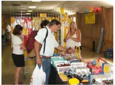
KARSFEST 2007 Lots of goodies await amateurs visiting the main air conditioned halls.