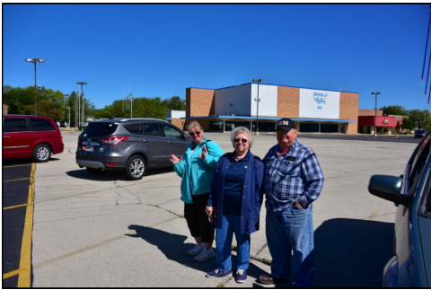
The hunters gather at the Meadowview starting point