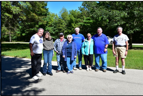
The hunters at the foxes lair—what a great way to spend a beautiful day!