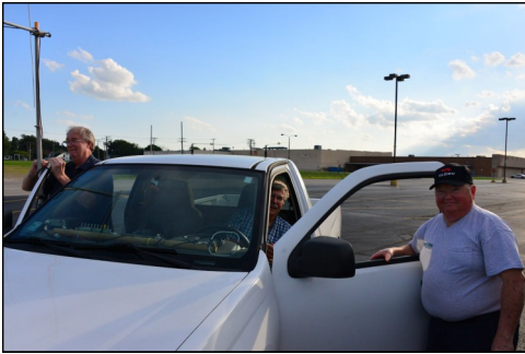
Winners: KA9TAG, N9DWE with K9KSG at the starting point