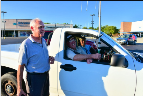
KB9VR & N9DWE team up to start