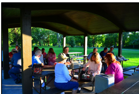
Fun at the KARS September picnic meeting

October 1 KC9SQG October 4 K9NIA October 4 W9BBB October 7 K9KOC October 7 NN9T October 13 WR9L October 14 N9YNZ October 15 K9IOC October 16 KB9NYW October 22 NV9L October 24 KB9ZQU October 26 WB9CDE October 26 K9NR