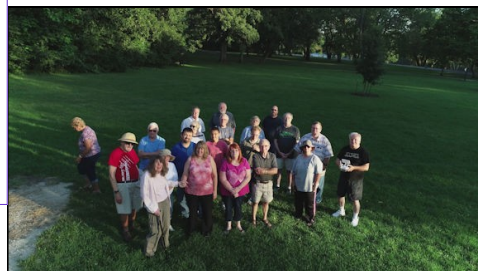
Aerial view of the KARS September picnic

Everything you need to know is at: http://www.w9awe.org/ILQP.html