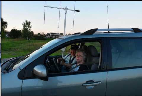
K9KSG & KD9CFV closing in on the foxes