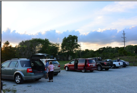
Hunters gathering at the fox's lair