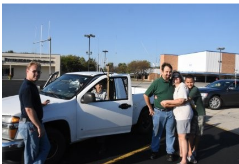
Hunters gather at the start