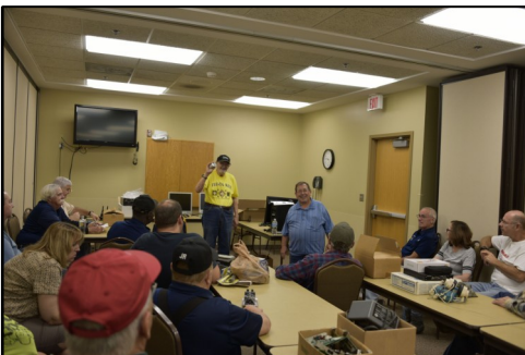
Action at the 2016 KARS Auction Don't miss out this year!

October 2 N9RJM October 9 KD9CGG October 16 N9OE October 23 K9NR October 30 K9KSG