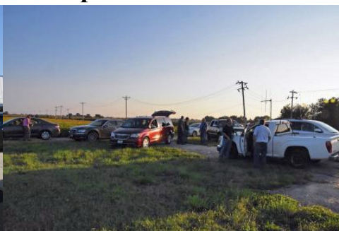
Eight hunting teams arrive at the fox's lair