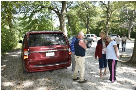
Comparing notes at the Fox's lair