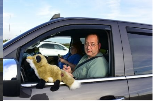
The Fox KD9FVM