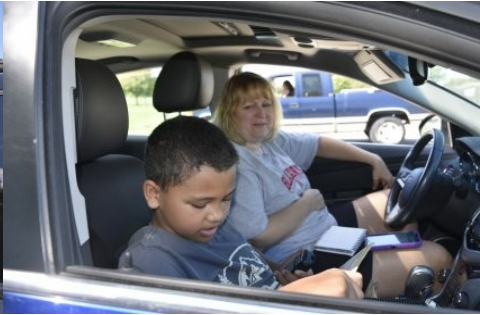
The Foxes N9BMB & N9DLD