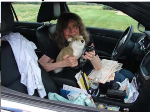
The Fox K9QT