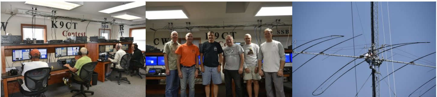
The operating positions at K9CT