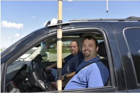
Winning Team N9OE & KD9FVM