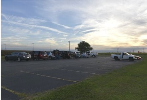
Hunters gather at the foxes lair in rural Bourbonnais