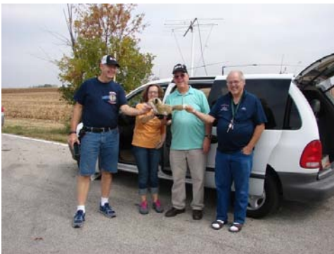
The Winning Team W9BBB, W9ARH, KB9VR, KA9MDJ