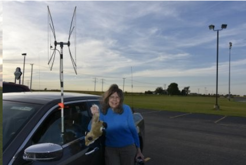
The Winner K9QT