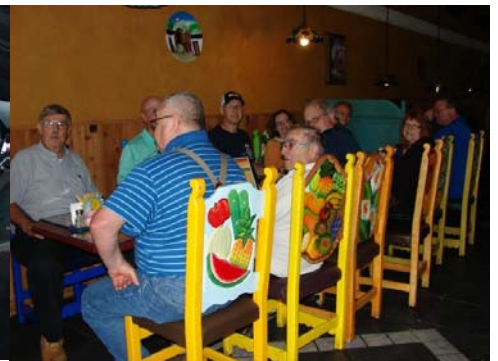
Food afterwards at El Mexicano's Yum!