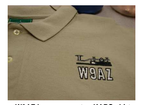
W9AZ logo on new tan KARS shirt

Let the newsletter editors know if we miss your birthday or get it wrong.