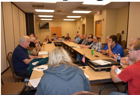
Eagerly Awaiting Start of Auction at October meeting

After a brief business meeting, there will be a program on Contesting with video graphics. See you there!