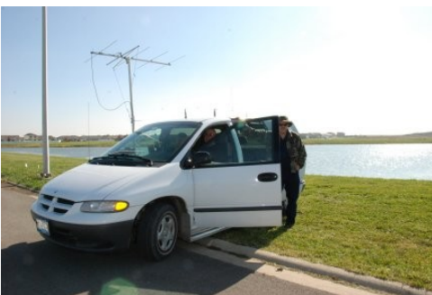
What do you mean "don't back up?"