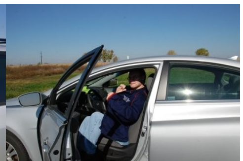
The winner! N9FD!