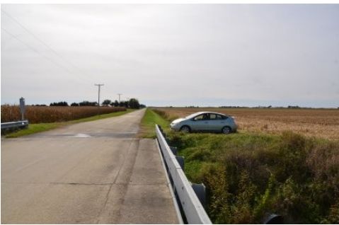
Clay N9IO The hide in plain sight fox