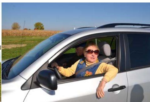
I'll never hunt again...till the next time!