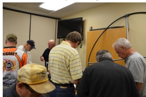
Members practicing their "I don't want to bid on that" stance...it never works! Was that a bid? Sold!!!