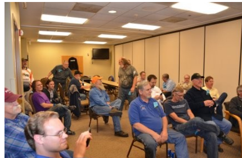
The annual auction always draws a crowd