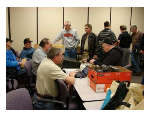
Bidders bull pen