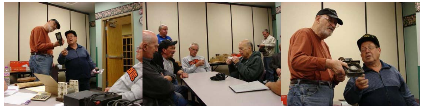
Will K9FO and Dan WA9WAQ sizing up an item for bidding