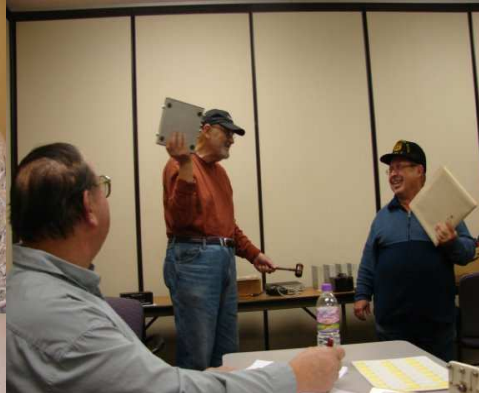
Auctioneers Will K9FO and Dan WA9WAO in action