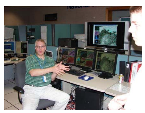
An NWS meteorologist explains the workings of one of the main control room positions where weather predictions and warnings are originated