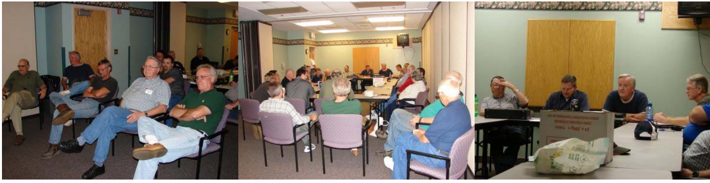
Eager bidders await the start of the annual KARS auction at the October meeting