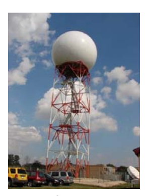
The state-of-the-art Doppler weather radar antenna