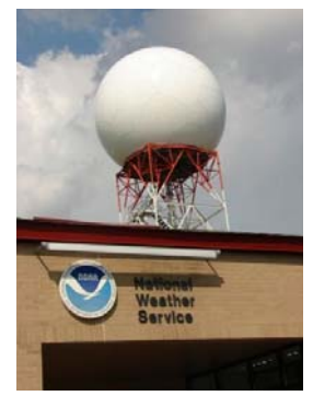
The National Weather Service Headquarters in Romeoville