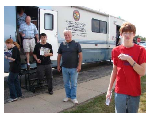
well equipped Will County Incident Command Vehicle