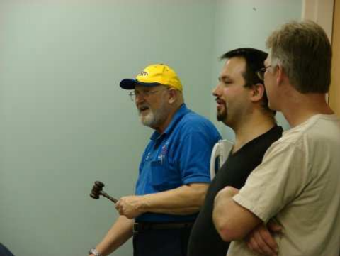
GAVEL AT THE KARS OCTOBER AUC- TION. WHILE BILL N9QXZ AND GREG WR9L DECIDE WHAT TO BUY

Note: The outside doors are locked at around 8 PM you can exit, just cannot enter after 8 PM. 73, AK9F