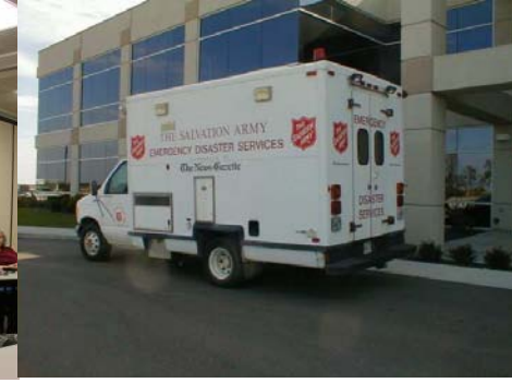
SALVATION ARMY EMER- GENCY DISASTER SERVICES VEHICLE AT THE EOC DUR-ING EMERGENCY DRILL