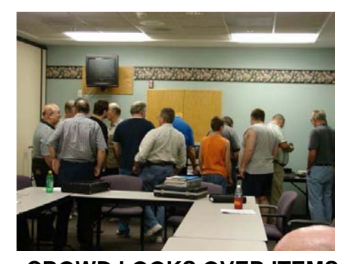
CROWD LOOKS OVER ITEMS BEING SOLD AT OCTOBER KARS AUCTION