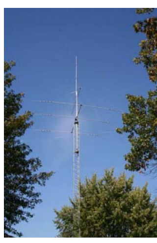
BILL, N9QXZ'S NEW TOWER PROJECT GLISTENS IN THE SUN