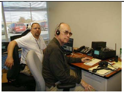
AK9F ASSUME THEIR OPER-ATING POSITIONS AT THE EOC FOR THE EMERGENCY DRILL