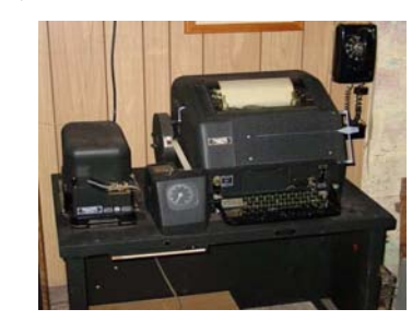
1950 vintage Teletype station, now replaced by a computer

Typical ham RTTY systems send messages at about 60 words per minute, which is about twice as fast as the faster CW operators, and about half again as fast as the popular PSK31 mode. And because it is so easy to put a competition grade RTTY station together, there has been a great increase in its popularity for contesting. In recent years, the number of entries in the many RTTY contests has ballooned.