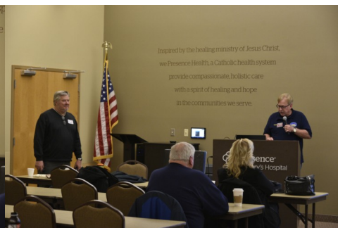
BOUVET Program (April Meeting)