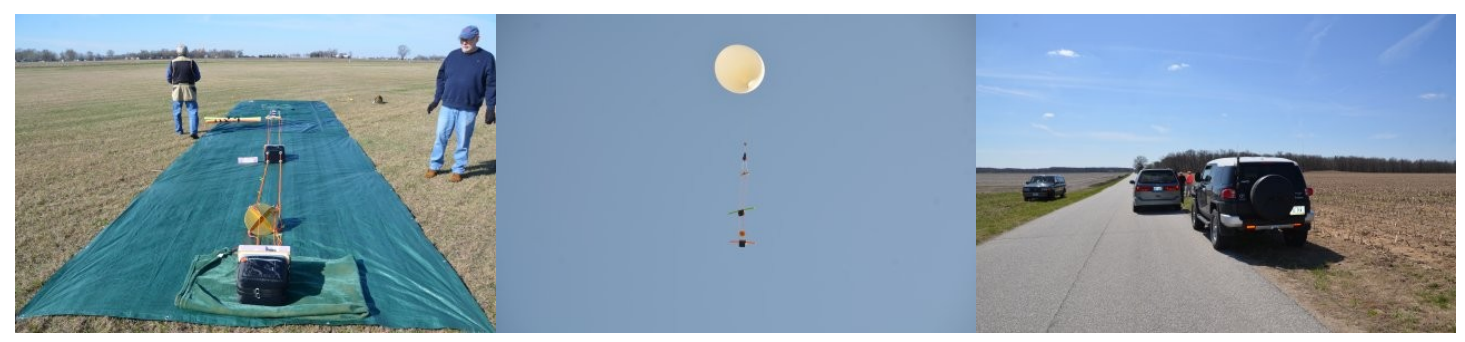
Lots of prep work