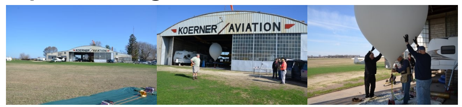
It takes nearly 2 large cylinders of expensive helium to fill the envelope