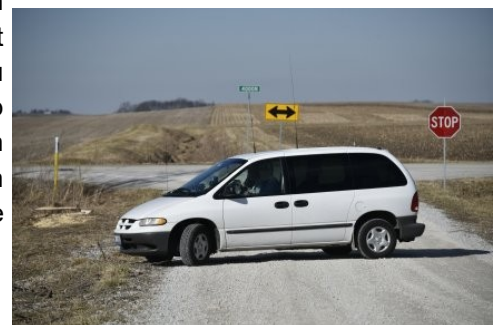
KB9VR & KA9MDJ arriving at the hidden transmitter.