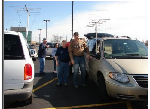
Rigging up at the start