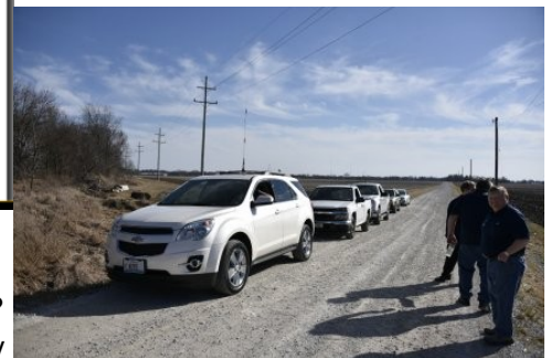
Hunters starting to arrive and lining up at the Fox's lair