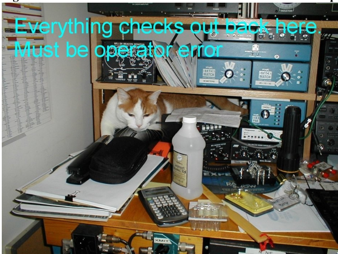
When troubleshooting in awkward places, four paws were better than two! Rest in Peace Louie