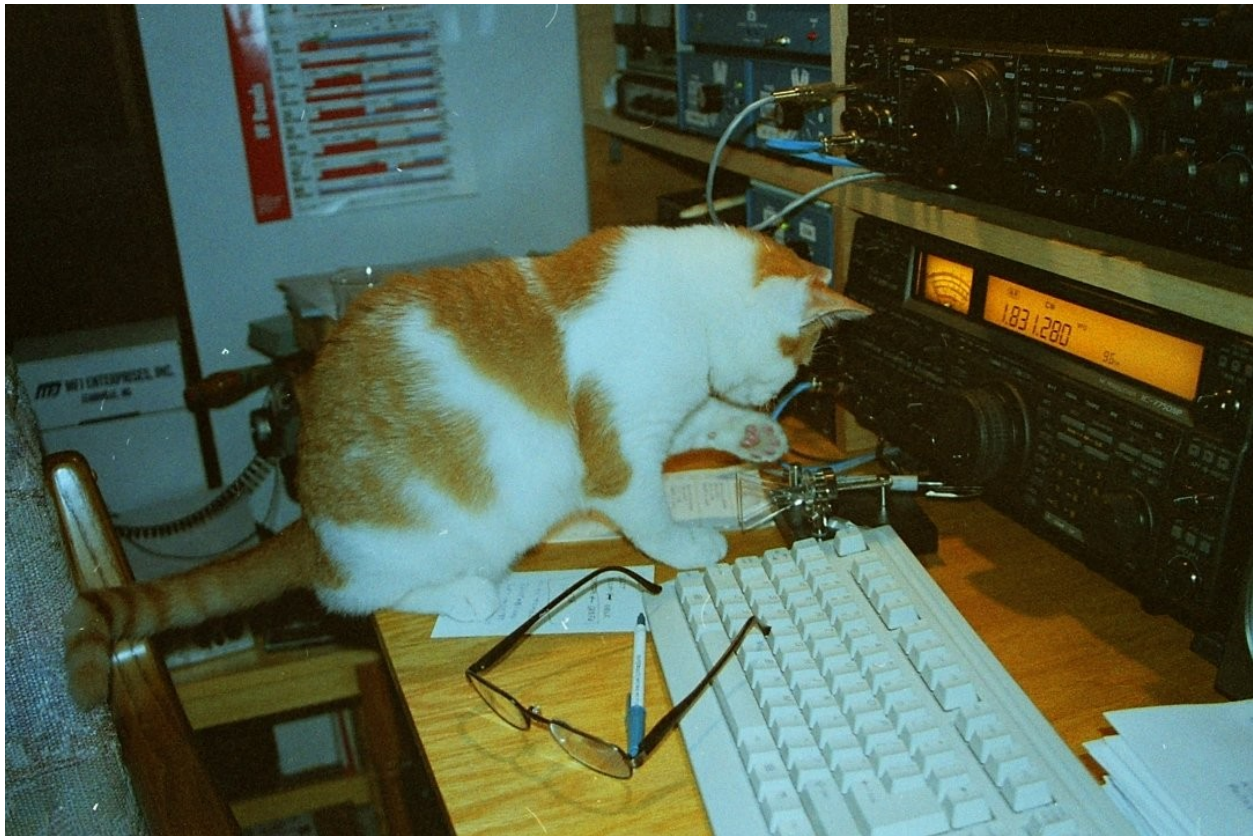
Pounding the Brass - Louie the Cat - Was The Purrrrrfect CW Operator