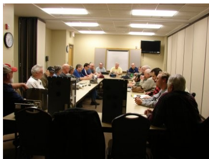
A view of the February KARS meeting, where the topic was "Amplifiers"

If we miss your birthday or get it wrong, please let us know!