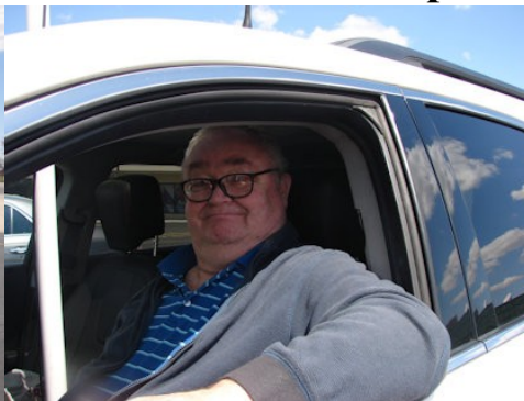
WU9D Sporting a transmitter hunt smile