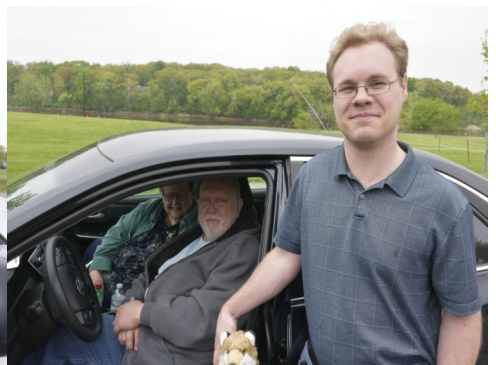
Winner N9FD with foxes N9IO & N9IOQ