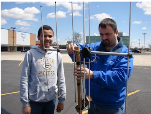
N9BMB & N9OE That doesn't look quite right Dad!