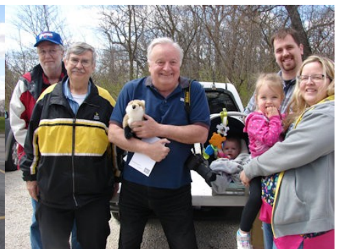
The fox K9NR with tied teams N9DWE/ KD9JMS & W9IOU/K9UNO family