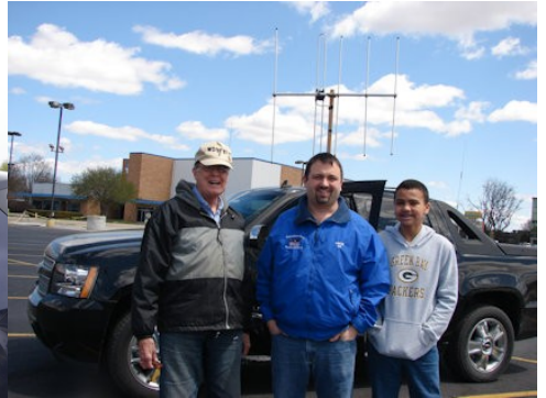
WD9FYF - N9OE - N9BMB