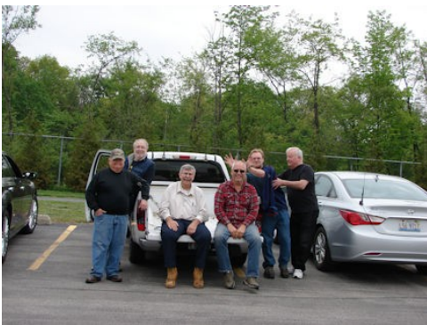
A gathering of eagles? Turkeys?