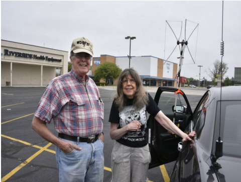
WD9FYF - K9QT