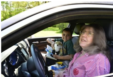
May 13 Foxes: N9BMB & K9QT

Single hop E Skip and occasional double hop is common now. Keep an eye (ear) on the Magic Band. Also, check out 2 meter SSB/CW for tropo propagation. Lots of fun to be had!