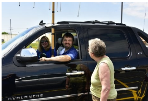
May 13 Winners: N9OE & N9DLD