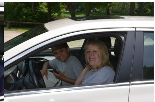
May 27 Foxes: N9BMB & N9DLD