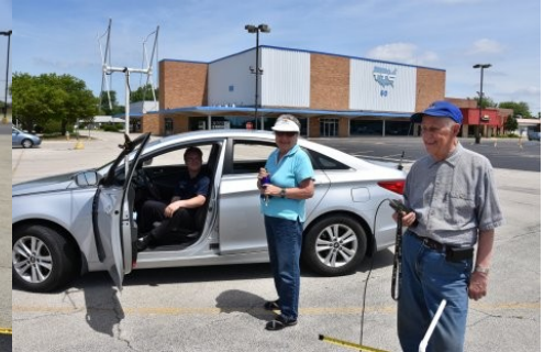
A few of the Hunters loaded and ready at the start N9RJM & WA9WAQ