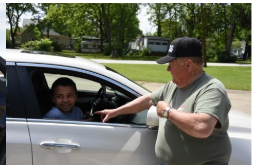
May 27 Winner: K9KSG