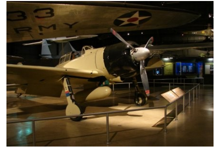
Wright Patterson Air Force Base, a favorite destination for hams in Dayton