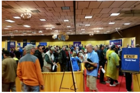
Celebrating it's 100th anniversary on Hamvention weekend, the ARRL's super booth was packed with activities all three days of the event.