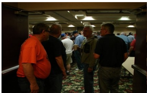
Evening activities at the Holiday Inn Conference Room