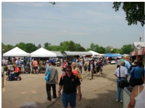
Acres and acres of flea market