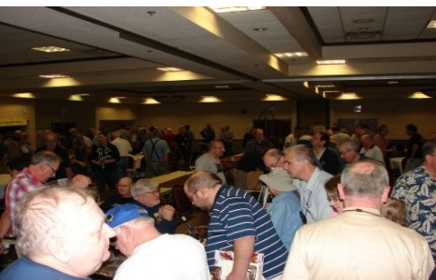
A packed hall devoted to QRP operators