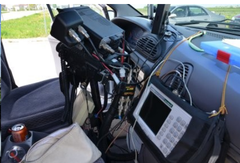
There's a dashboard in there somewhere!