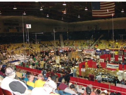
The view from the main arena seating