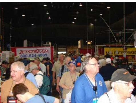
A small group of the 20,000 plus hams at the Dayton Hamvention