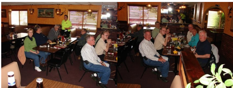
The post hunt get together at El Campesino's Restaurant