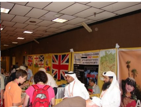
Representatives at the Qatar Amateur Radio Society booth