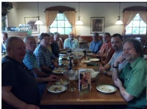
Dinner upon arrival in Dayton