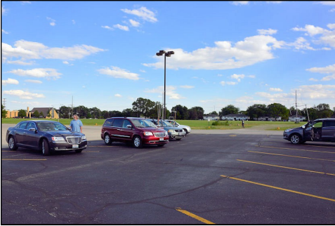
Hunters arrive at the embarkation point in the Meadowview Shopping Center