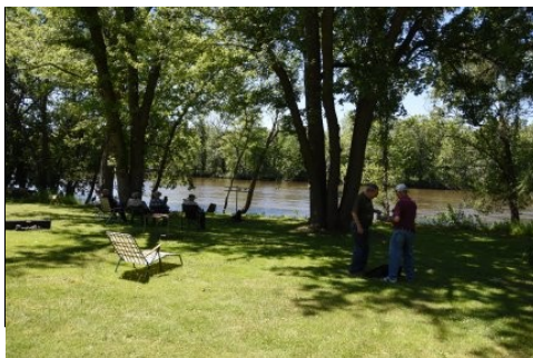
Ham Radio outdoors In the good old summer time!