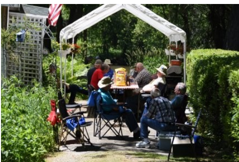
160 Picnic at the K9FO Momence river cottage