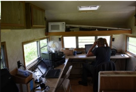
Inside the EMCOMM trailer