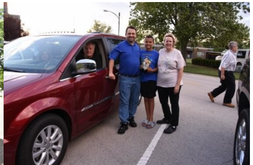
Fox: K9NR Winners: N9OE, N9DLD & N9BMB at the June 28 Foxhunt