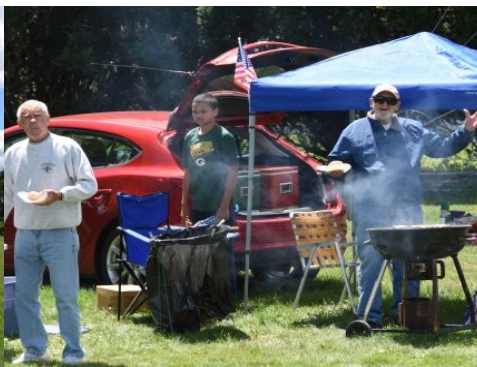
K9FO manning the grill! Yum!

For Sale (All priced for quick sale) IC-746 with 1.9khz and 350hz filters, (Filters are worth $200) Automatic Tuner. 100 watts 2 meters and 6-160 m. Very clean in excellent condition. $600 FT-857d with separation Kit. I purchased the FT-857d at Hamvention in 2012 from AES. Has never been installed or connected to power. All pieces still in their cellophane as when it was shipped. It is NEW! 440mhz, 2m, 6-160 meters. $600 Email Clay N9IO n9io@hotmail.com