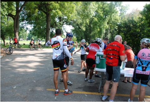
Bicyclists at the Momence River Island food & water stop during a Two Rivers Century Bicycling Tour