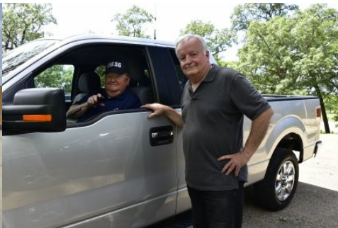
Fox: K9KSG Winner: K9NR At the June 17 Foxhunt