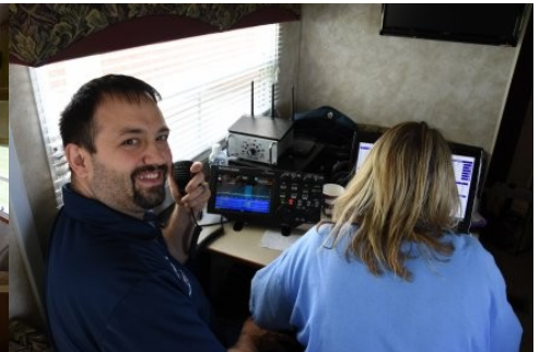
N9DLD & N9OE working the bands