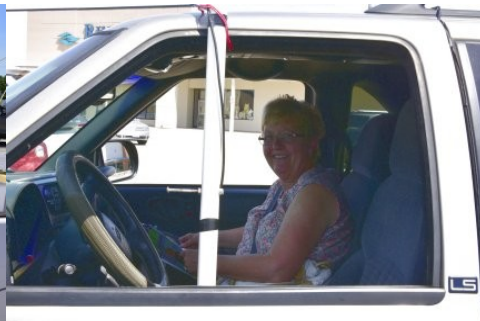
N9SEW—Half of the N9RJM Team