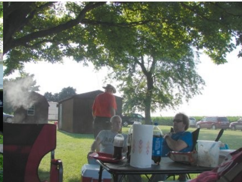
K9CS, W9IE & FD host N9REG enjoying the Saturday cookout