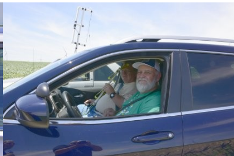
N9HJR & KD9GHM - The Winners!