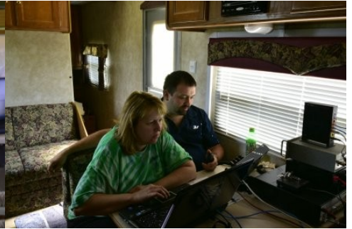
N9DLD & N9OE working SSB on the bands