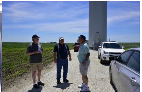
Hunters gather around the fox