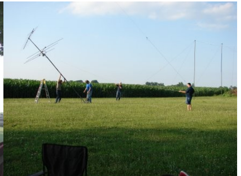
Erecting the skyhooks