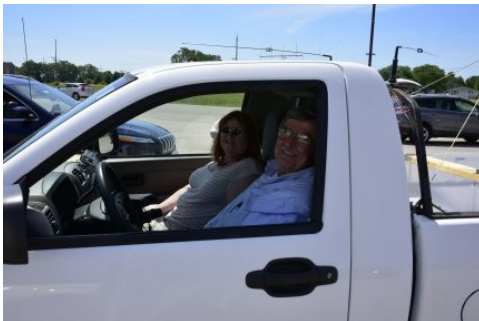
N9DWE & XYL MJ ready to hunt