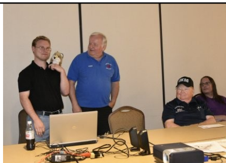
The June KARS meeting on fox hunting. Fox N9FD on left