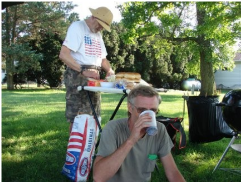
K9FO manning the grill for feeding time