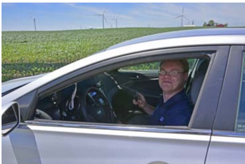
N9FD The Fox