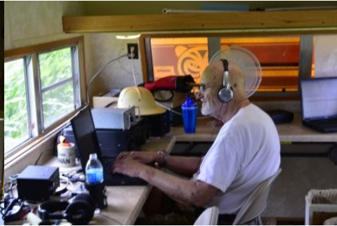
K9FO cranking them out On 20 meter CW