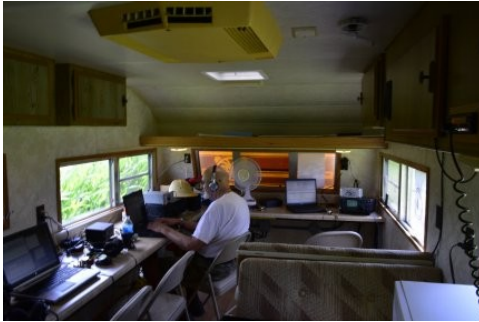
KARS EMCOMM Operating Positions