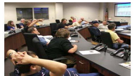
Talk about luxury! KARS members are seated in plush chairs at the EOC for June meeting. Wouldn't they make for nice seating in the hamshack?

Bring your own tableware, beverages, chairs , as well as a side dish or dessert to share. If you have an extra grill, it would be helpful and speed up cooking time. Extra tables and mosquito spray might also come in handy.