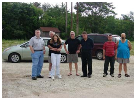
Some of the Foxhunters pose for a picture at the Fox's Den in Chebanse