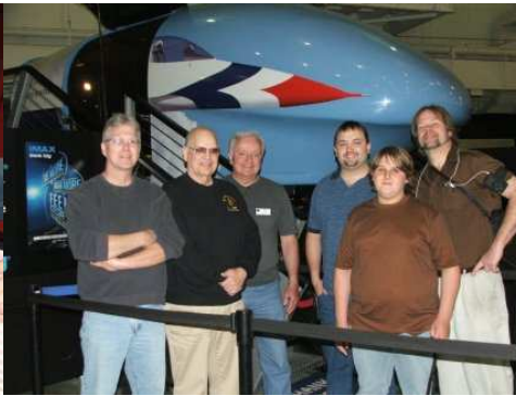
Some of the KARS gang about to enter the flight simulator at the Air Force Museum at Wright-Patterson AFB in Dayton