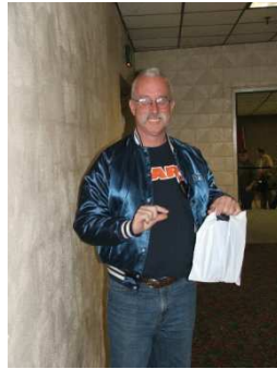
Cal N9LCX talks about the big one that got away