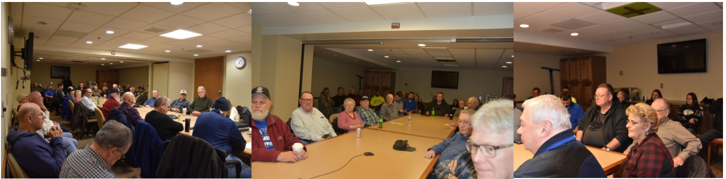
KARS members listen closely to NV9L's description of the numerous "go to" kits provided by the ARRL

If it is a WB9Z / NV9L kind of program, you better arrive early if you want a seat!