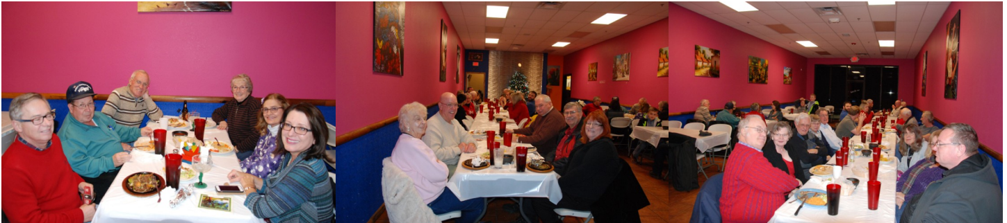
That's a lot of smiling faces