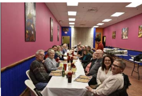
The "unofficial" KARS New Years Eve Dinner

Let the newsletter editors know if we miss your birthday or get it wrong.