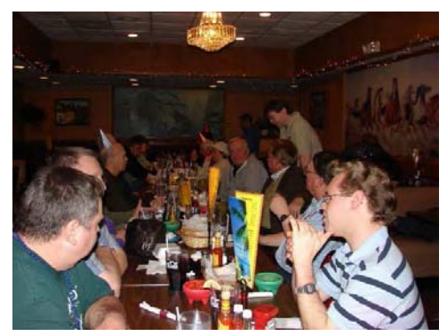
News Year Eve at El Campesino's and the living is fine for this group of KARS members