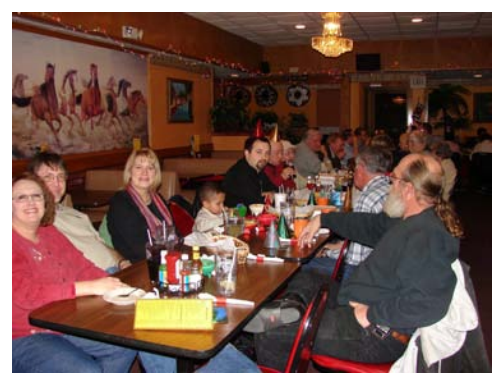
More of the gang hungrily waiting for their food. "Muy Bueno!"