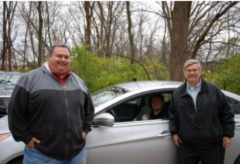
November 19th Hunt Fox N9FD & Winners N9DWE & KC9YDA