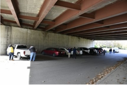
November 5th Hunt Hunters arriving at fox's lair