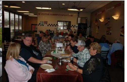
November 19th Hunt After Hunt Dinner at Mancinos