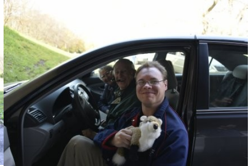
November 5th Hunt Fox W9IEY & Winner N9FD