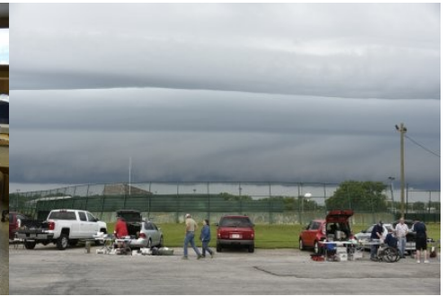
Foreboding clouds over the flea market