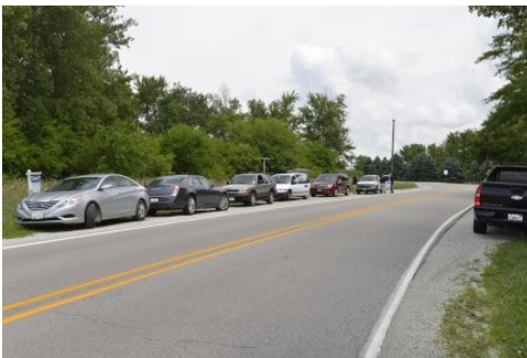
Hunting teams lined-up at the foxes lair— waiting for the remaining hunters