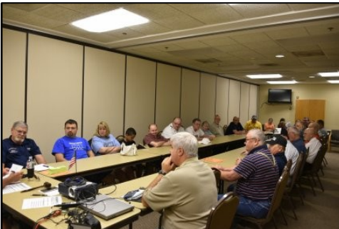
KARS July meeting

August 1 KD9CGC August 8 K9KSG August 15 N9OE August 22 K9NR August 29 N9RJM Don't forget the net!