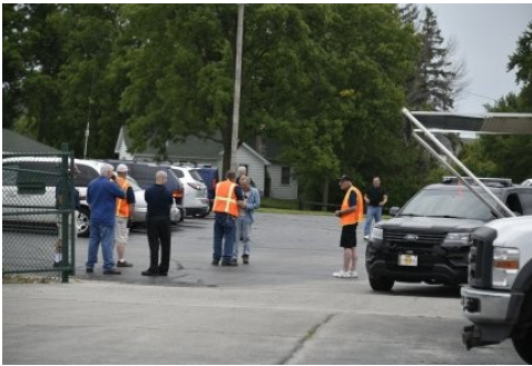
Manning the gate at KARSFEST