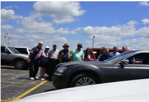
Group photo at the start