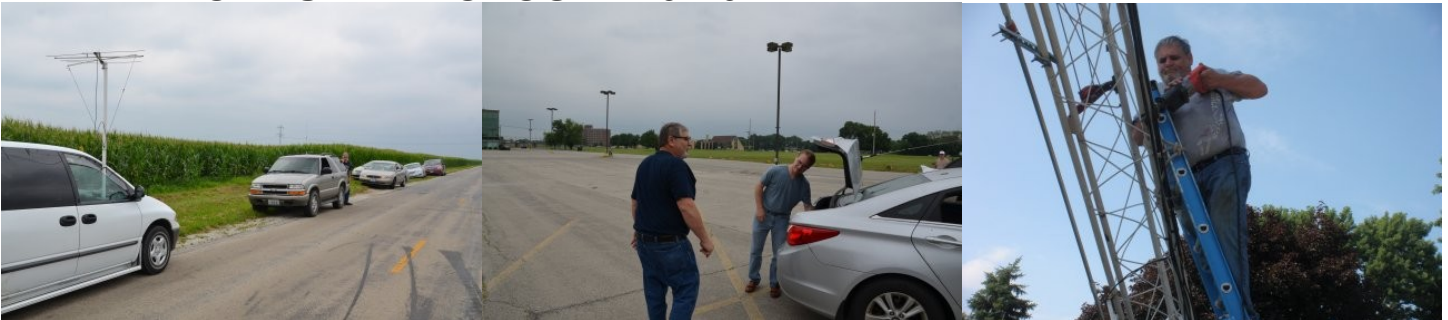
Tall Illinois corn "or" RF Waveguide/Tunnel?