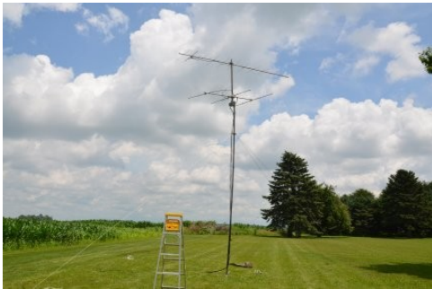
Sections of fiberglass poles supporting the 6 and 2 meter Yagi's