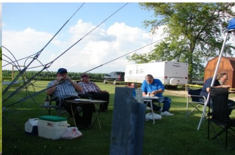
Hungry hams prepare to chow down. So much food, so little time. Everyone takes a break to enjoy the goodies from home and Will's good cooking.