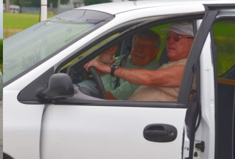
N9DWE and KB9VR driving