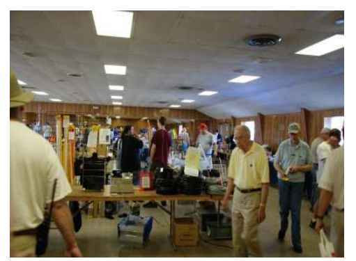
The main air conditioned main hall provided cool comfort for those, looking for bargains at KARSFEST