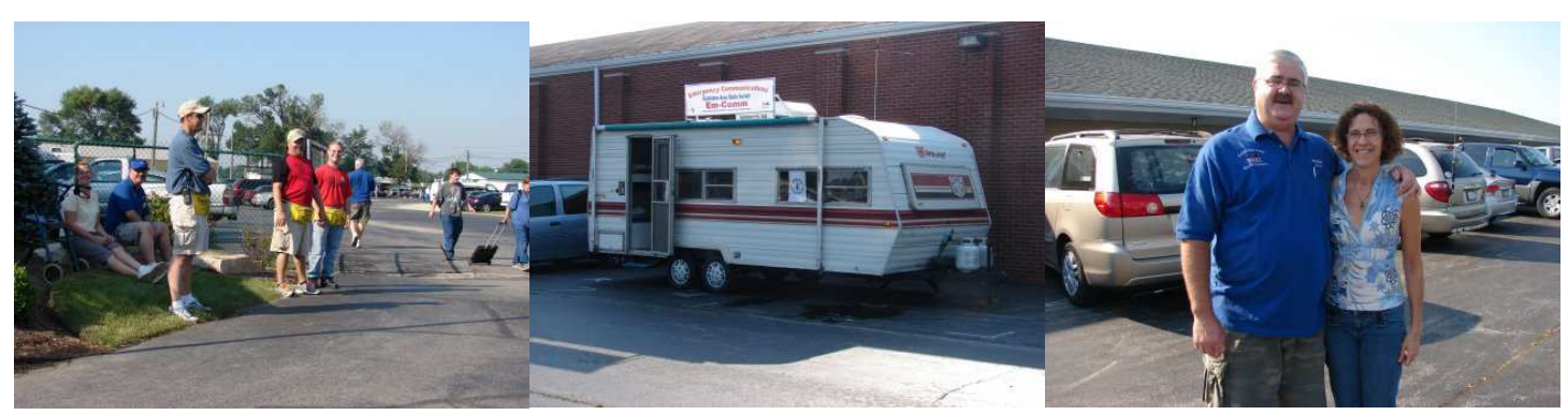
KARS members taking their turn at manning the gate