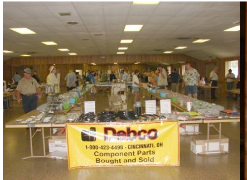
One of the many vendors inside the building at KARSFEST