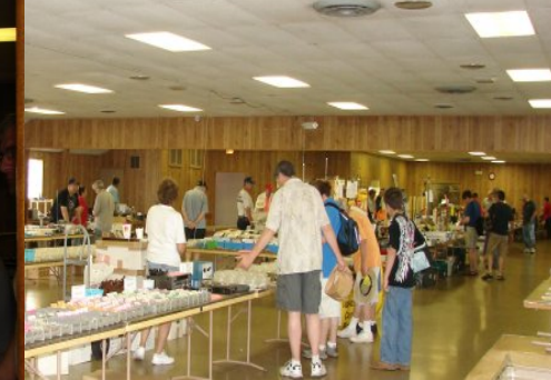
Hams, keeping their cool, shopping in the main hall at KARSFEST