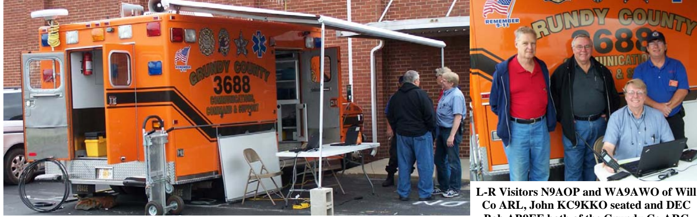
The Winlink demonstration inside was remote through the Emergency Communications Vehicle of the Grundy County Amateur Radio Club / ARES.

Membership is now open to the Illinois Amateur Radio Emergency Services® Digital Working Group. Visit this Yahoo Group web site at http://finance.groups.yahoo.com/group/IL ARES DWG/ all IL hams invited. Please participate in the group. By N9IO.