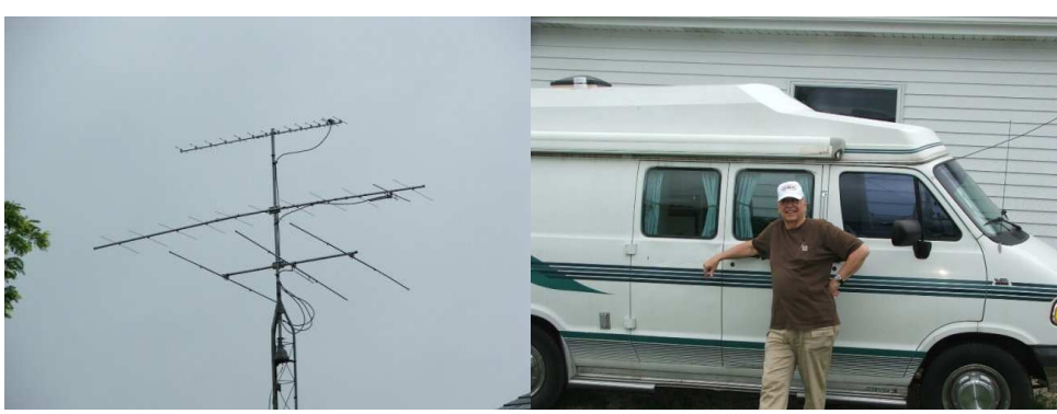
Skyhooks for 6 & 2 meters & 70 centimeters