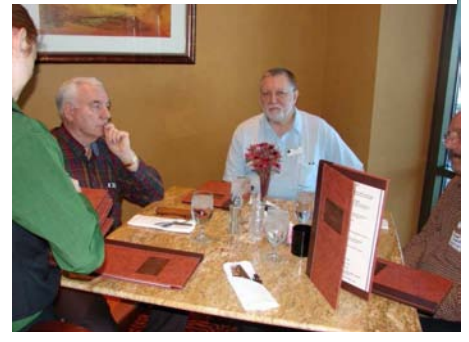
Clay N9IO discussing strategy with fellow SMC contesters