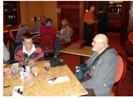
Will K9FO enjoying a light moment at the luncheon