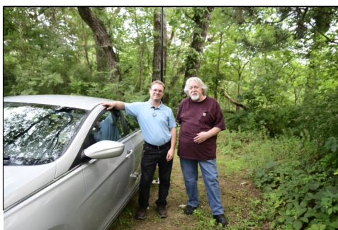
N9FD & N9IO at the August 10th Fox's lair. Last known picture of N9FD before being totally consumed by a massive cloud of twin engine mosquitoes. Still, it was a great hunt!