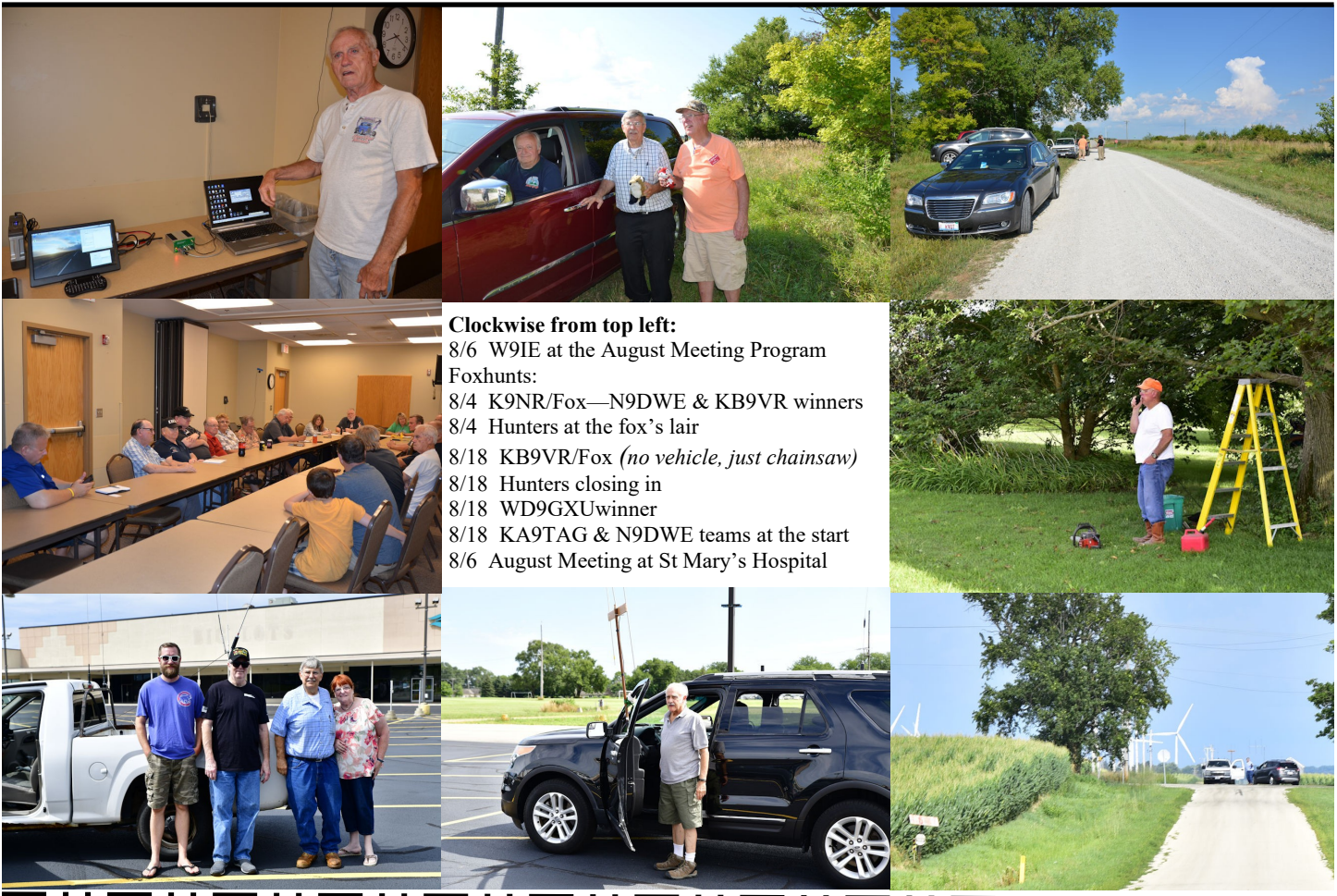
Clockwise from top left: 8/6 W9IE at the August Meeting Program Foxhunts: 8/4 K9NR/Fox—N9DWE & KB9VR winners 8/4 Hunters at the fox's lair 8/18 KB9VR/Fox ( no vehicle, just chainsaw ) 8/18 Hunters closing in 8/18 WD9GXU winner 8/18 KA9TAG & N9DWE teams at the start 8/6 August Meeting at St Mary's Hospital