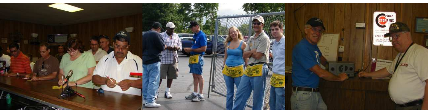
Hams stand in line to fill out their ticket stubs and put them in the drum for the first prize drawing