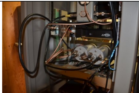
Rear view of the new 444.800 repeater during installation

Anything radio, electronic, computer related is appropriate. Probably best not to bring your new $8K rig...unless you want to sell it cheap!