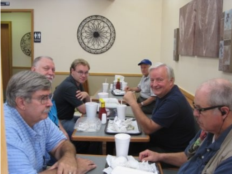
The post hunt gathering at Poor Boy's 2