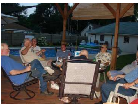
It was starting to get dark before the KARS group settled down enough to hold a very "brief" business meeting.