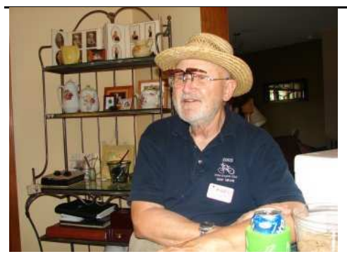
Will K9FO takes an indoor break to sneak some snacks from the buffet table.