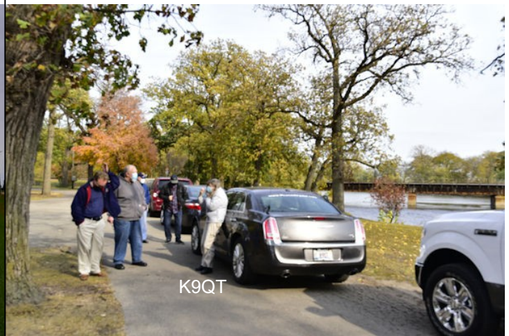
Beautiful day on Momence Island