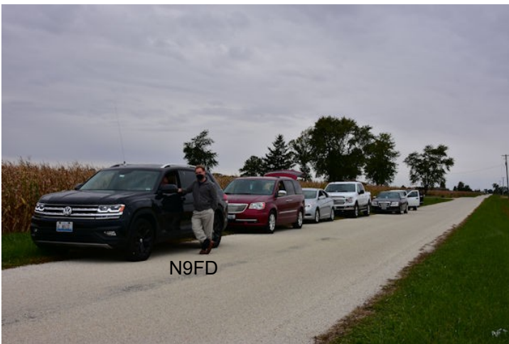
The lineup at N9IO, the fox’s lair