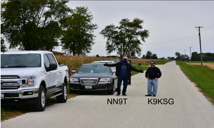
NN9T “The fish was this big”