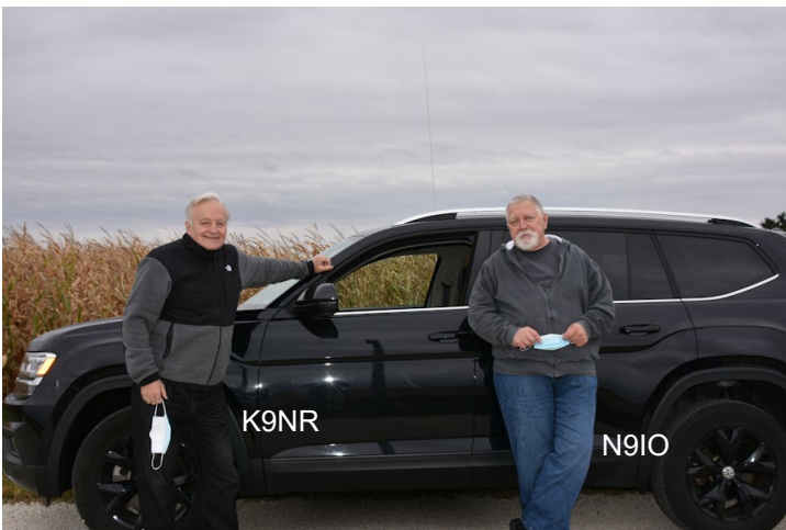
Winner K9NR’s safe spacing picture