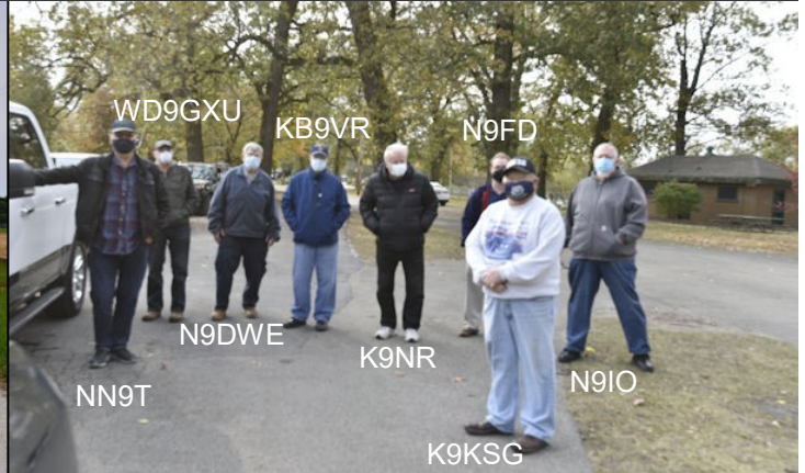
K9NR, the Fox and friends