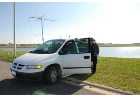
Y j c v " f q " { q w " o g c p " ð K ø m ø v ' p ç α g m " v j w p ö " c i The winner! N9KDI n " v j g " " next time!