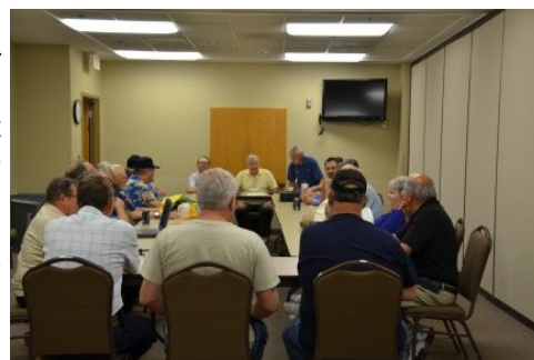
Taking care of business