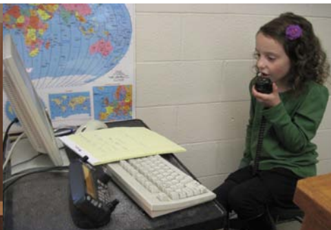
W9KVR's Harmonic Sophie makes a contact in South Carolina from W9GRS in Watseka