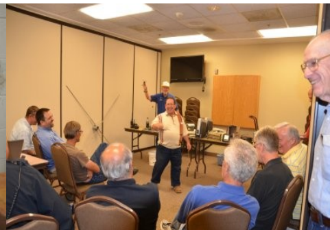
Another auction action shot at the October meeting