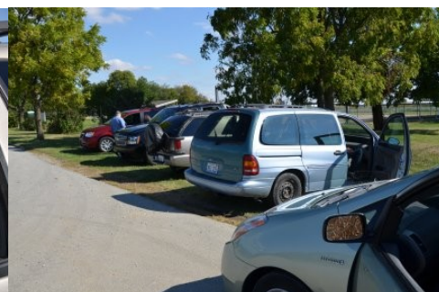
Hunters gather at the finish