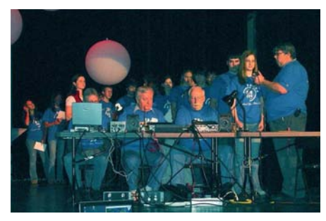
The big day Students contact the International Space Station