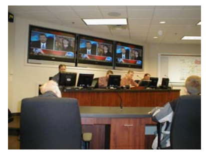
KARS holds meeting inside the command center of the EOC