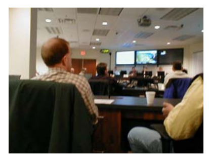
County officials hold a critique of Emergency Exercise at the new command center