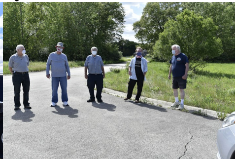
Who was that masked man?