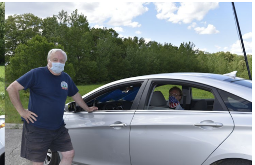
Winner K9NR with Fox N9FD