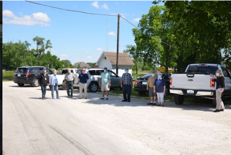
A beautiful summer day for a hunt!