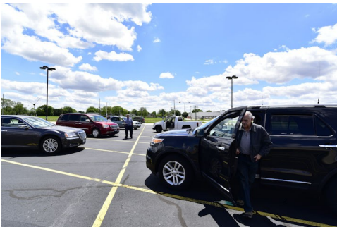
Hunters gather at the starting point