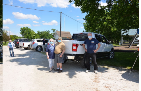
The winners: K9KSG and KD9CFV