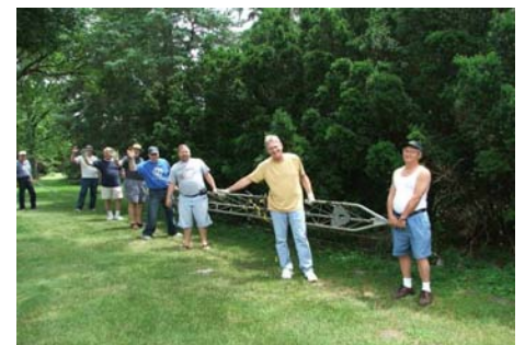
Putting away the tower for another year takes a lot of ham power