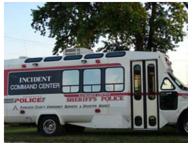
Kankakee County Incident Command Vehicle