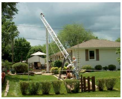
ANTENNA PARTY W9YNI STYLE