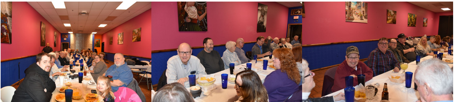
Lots of smiling faces!