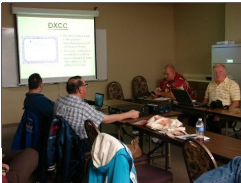
The program on DXing at the November KARS meeting

After the mundane but necessary tasks are completed, there will be an interesting program on antennas and feedlines. Have you ever wondered why an antenna radiates? Have you ever wondered why everything is based on 50 ohms and not 100 ohms and what does RG and BNC stand for? Come to the December KARS meeting and find out these mysteries and more. See you there!