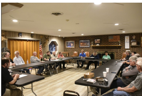
KARS monthly club meetings at the Bradley Bourbonnais Sportmen's Club